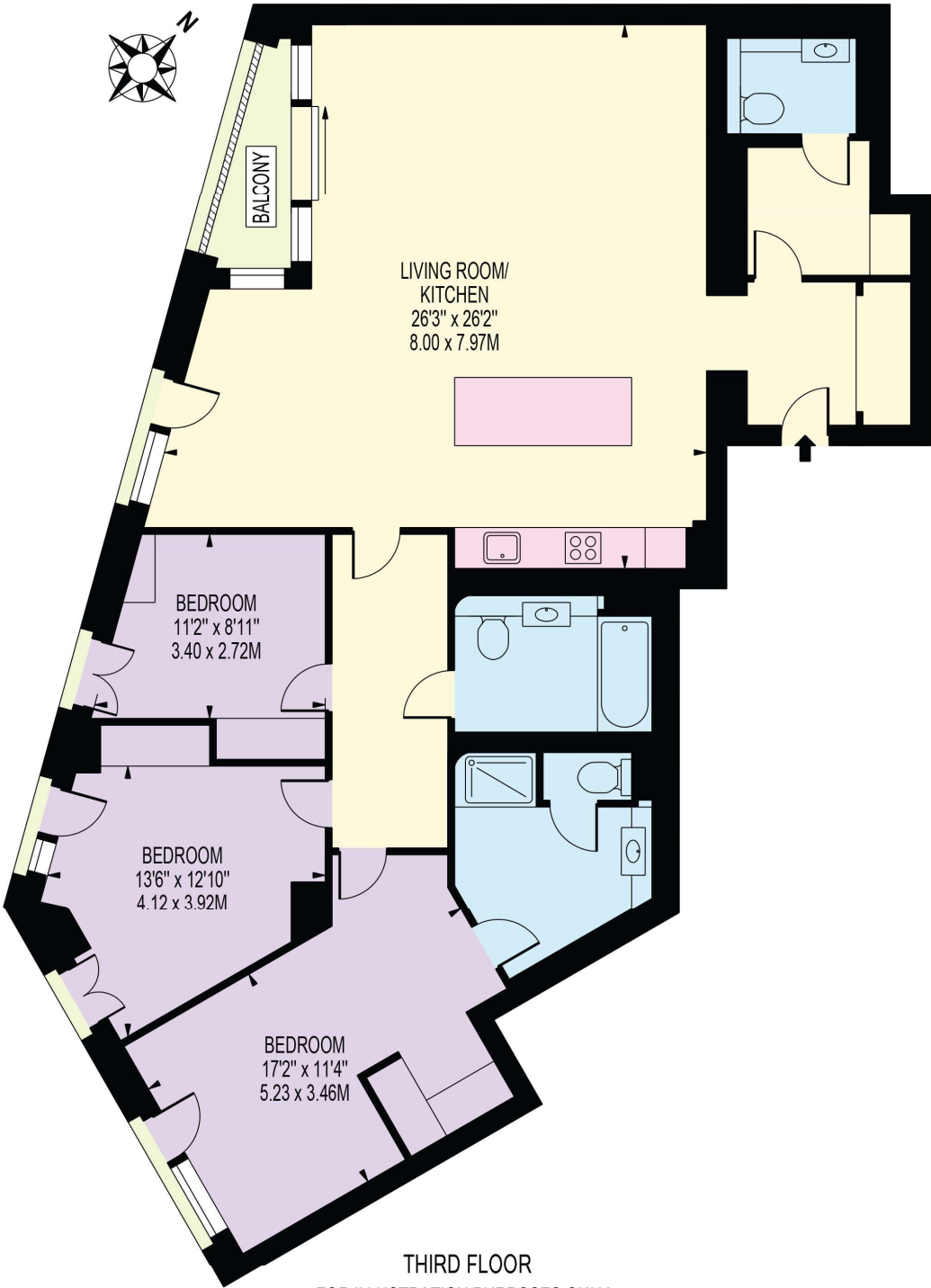
THIRD FLOOR FOR ILLUSTRATION PURPOSES ONLY

APPROXIMATE GROSS INTERNAL FLOOR AREA: 1455 SQ FT - 135.17 SQ M